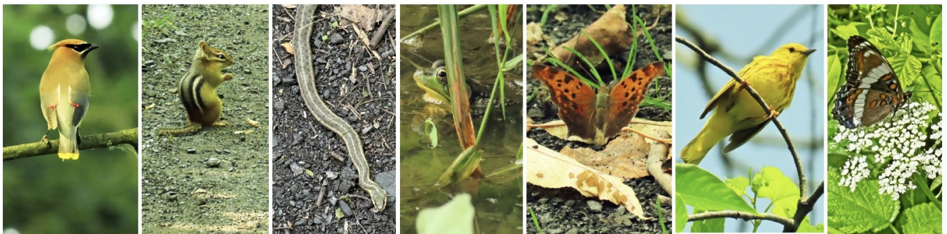
Cedar waxwing Chipmunk Garter snake Bullfrog Question mark Yellow warbler White admiral

As usual, all photos shown here are from the past couple of weeks.