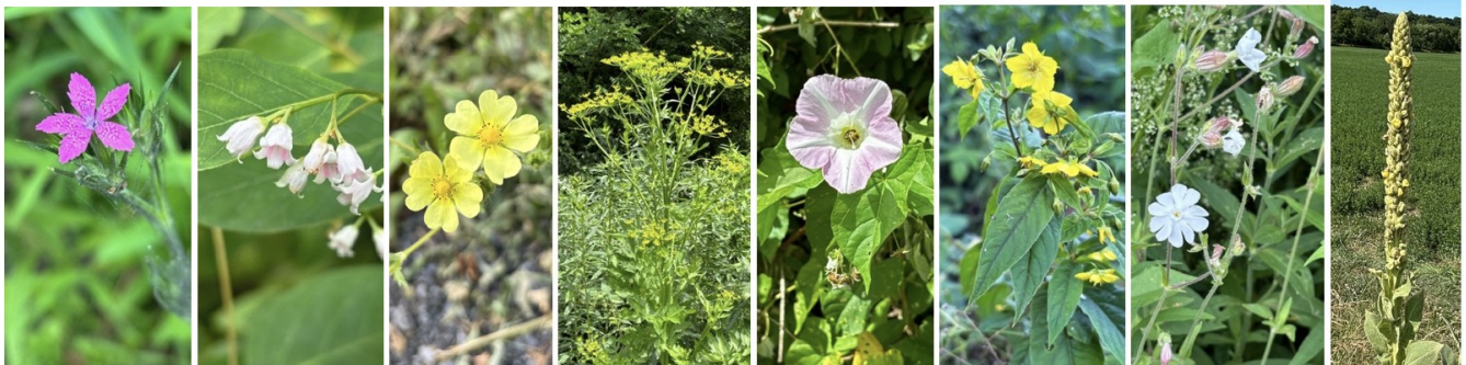
Deptford pink Spreading dogbane Cinquefoil Wild parsnip Hedge bindweed Spreading loosestrife White campion Mullein