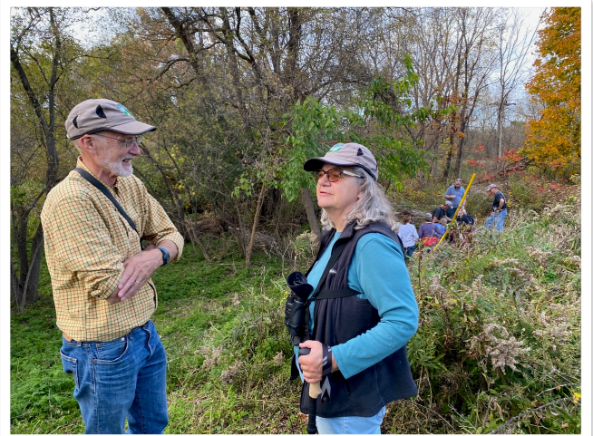
Kirkland Trails members look at Sherman Brook, October 25, 2023.