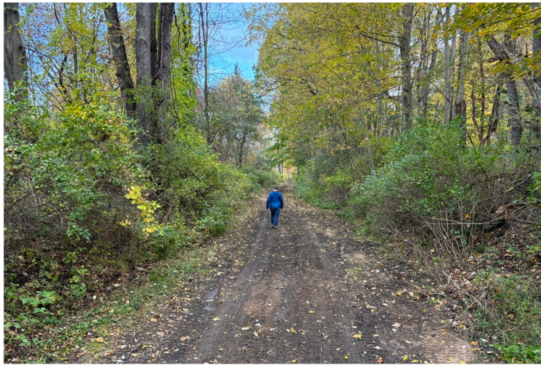
Walking on Kirkland Trail Phase 1 North, October 20, 2023.

Anyone who is interested in joining members of the Kirkland Trails board in seasonal trail cleanup activities, please contact kirklandnytrails@gmail.com for more information about possible opportunities.