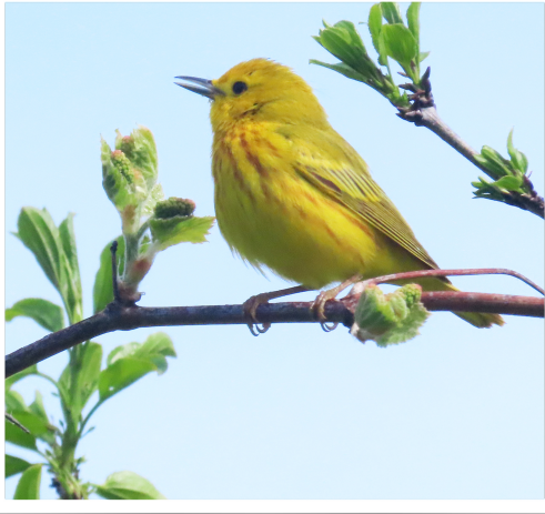
Yellow Warbler, May 14, 2023.

at this point, and continued vocal public support may still help.