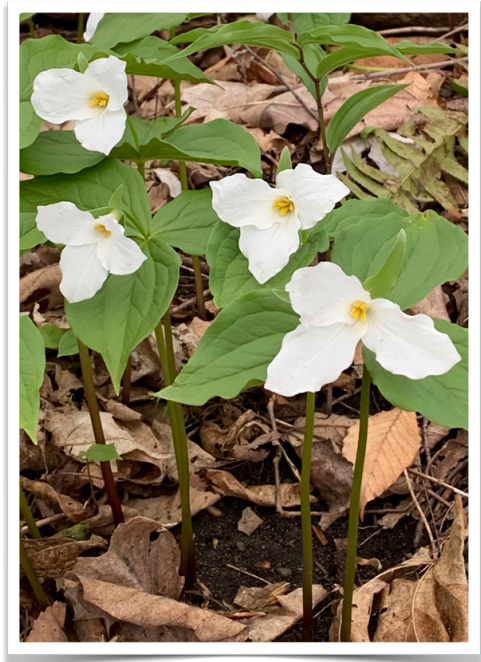
White Trillium, April 25, 2023.

Kirkland Trails is the official sponsor for a second DRI proposal: to construct a pedestrian bridge over Sherman Brook. With a pedestrian bridge in place, Kirkland Trails will be able to extend our planned recreational trail system north of the village along the abandoned Chenango Canal and railroad corridors, past scenic ponds and wetlands, and eventually connect with trail systems in neighboring communities. We expect the bridge to be located on the northwest (Kirkland Ave.) side of the old Chenango Canal, crossing where