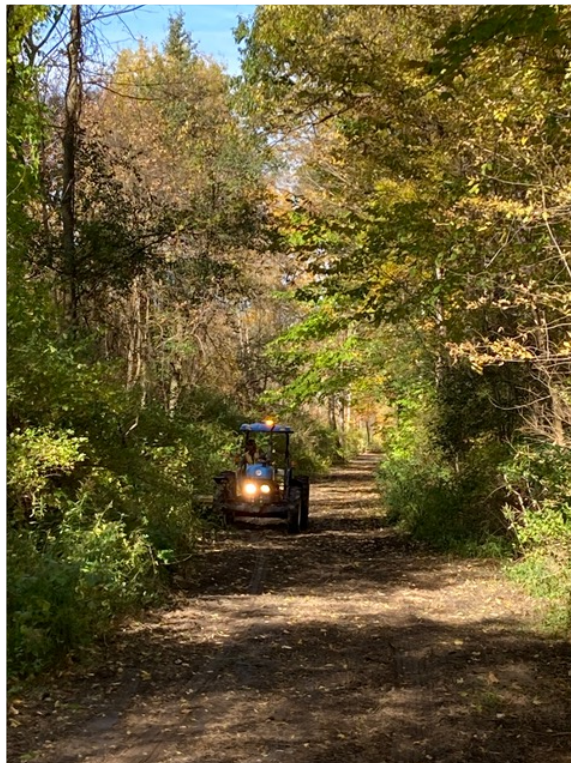
Work on the Kirkland Trail north of the Dugway trailhead, 10/19/2023.