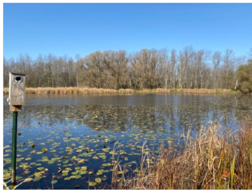
Wood Duck Pond, along the proposed northern route