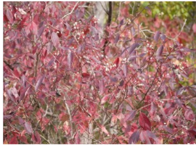
Grey Dogwood in autumn